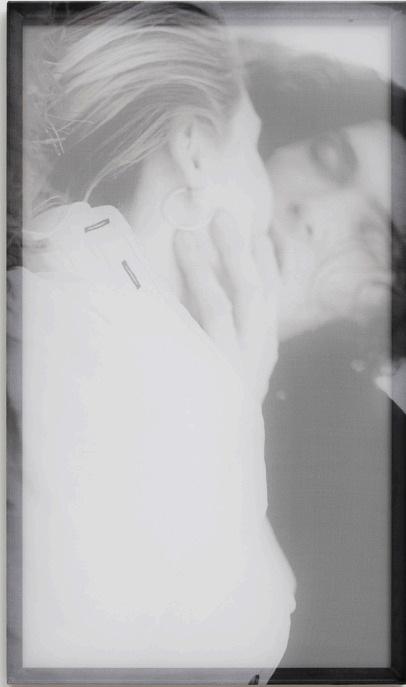
Zoe Chait, touch , 2021. Inkjet on organza, angle iron, 27 x 46 x 1 ½ inches. Unique.