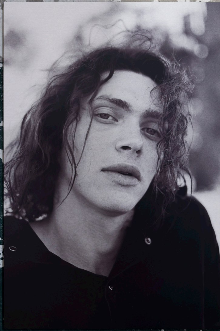
Zoe Châit, echo park lake , 2021. (Edition 1 of 5 + 1AP). Dye sublimation on aluminum, 10 x 15.