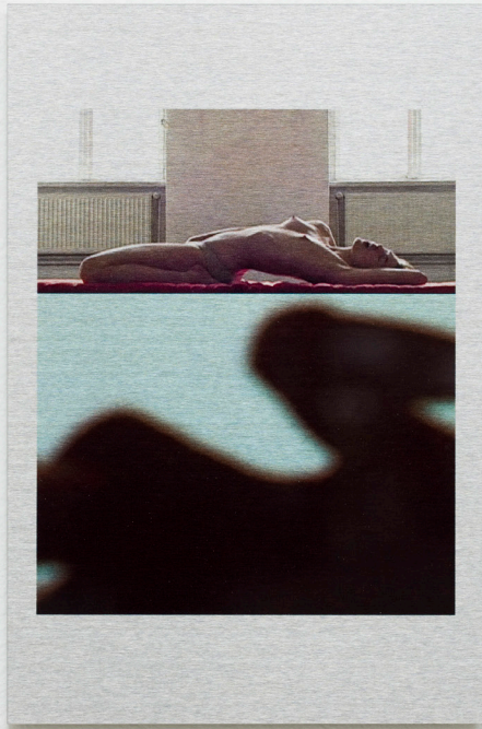
Zoe Chait, shadow , 2018. (Edition 1 of 7 + 1AP). Dye sublimation on aluminum, 4 x 6 inches.