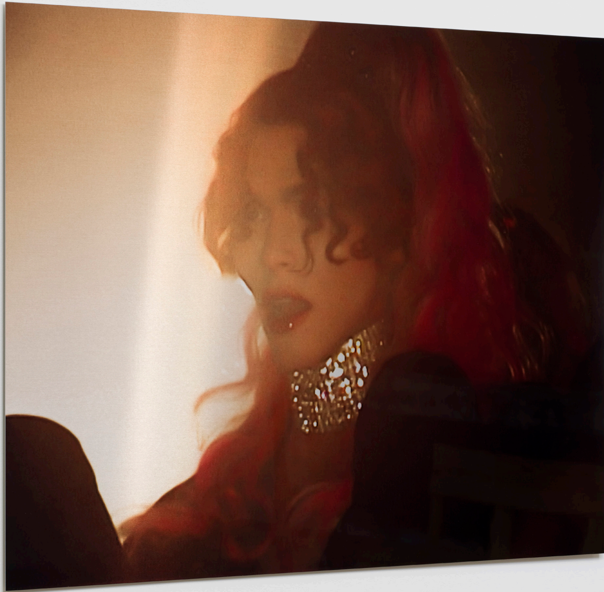
Zoe Chait, what dream , 2021. (Edition 1 of 5 + 1AP). Dye sublimation on aluminum, 30 x 40 inches.