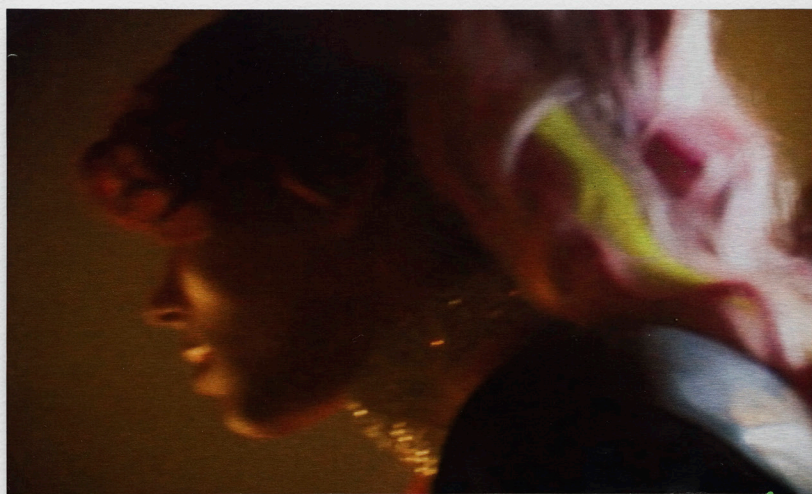
Zoe Chait, motion , 2017. (Edition 1 of 7 + 1AP). Dye sublimation on aluminum, 3 7/8 x 6 3/8 inches.