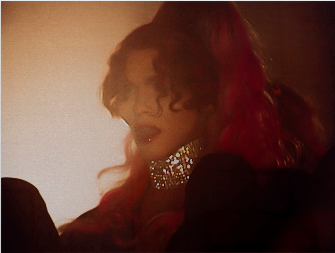
Zoe Chait, what dream , 2021. (Edition 1 of 5 + 1AP). Dye sublimation on aluminum, 30 x 40 inches.