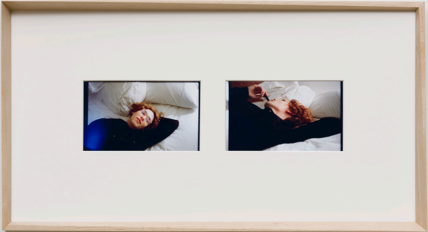
Zoe Chait, soft, juul , 2017. (Edition 1 of 3 + 1AP). Dye sublimation print, 10 ½ x 19 ¼ x 1 ½ inches framed.