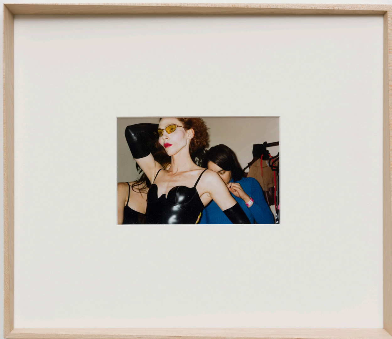
Zoe Chait, lubricate , 2018. (Edition 1 of 3 + 1AP). Darkroom C-print, 13 ½ x 15 x 1 ½ inches framed.